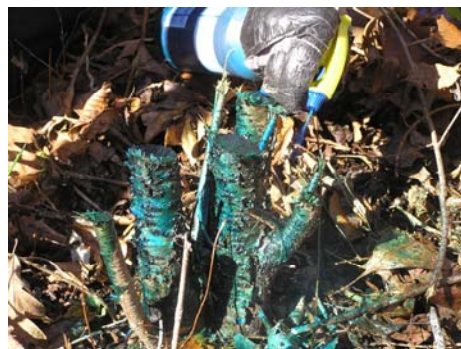
Blue herbicide carefully applied

Under the supervision of RINHS, CLT will plant a native shrub border that will serve as a model for other RI organizations encountering exotic plant removal and restoration.