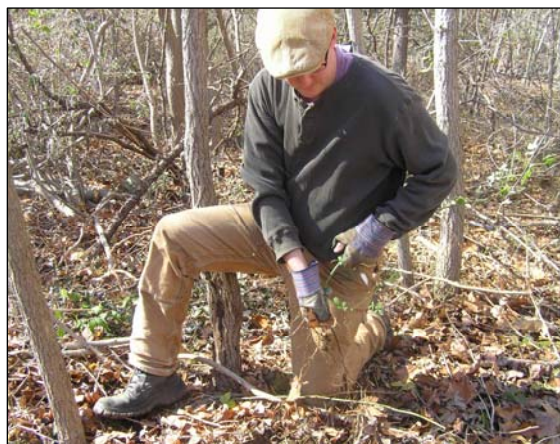
Hand pulling invasives