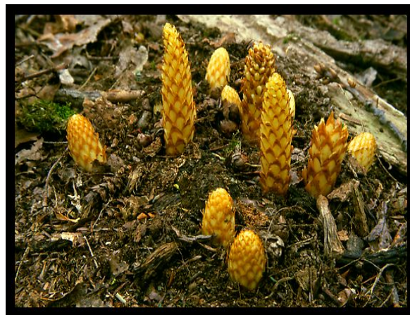
Conopholis americana 'Squawroot' or 'Bear Corn' RI state listed rare plant.