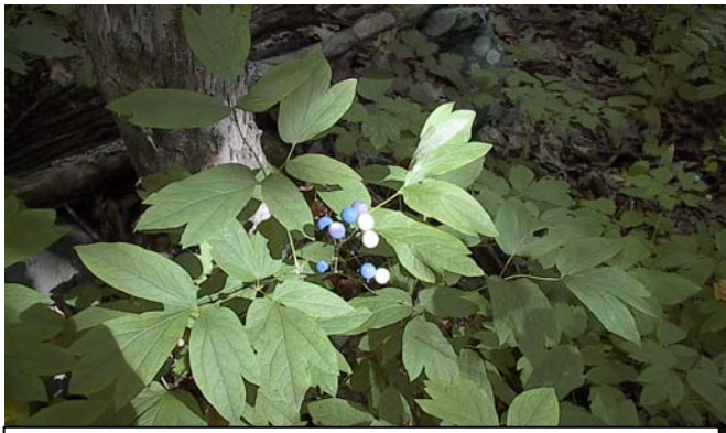
Caulophyllum thalictroides , Blue Cohosh . Divided leaves with yellow-green flowers on a branched stalk. Grows in rich woods. Rare.

The Botany 2010 Annual Conference will take place this year in Providence RI from July 31 to August 4. The joint meeting of leading scientific societies will include the Botany Society of America, American Fern Society, the Byrological and Lichen Society, and American Society of Plant Taxonomists. High Rock Farm Preserve is to be featured as a full day field trip for attendees of the conference. Field trips are organized to visit areas of botanical interest in the areas around he meeting.