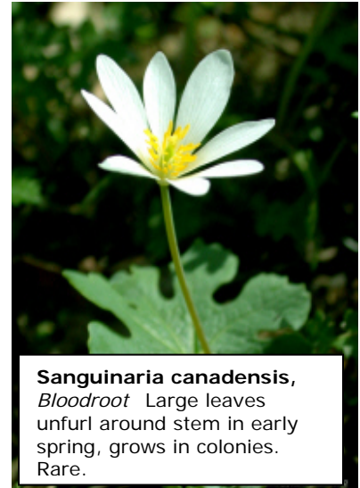
Sanguinaria canadensis , Bloodroot Large leaves unfurl around stem in early spring, grows in colonies. Rare.