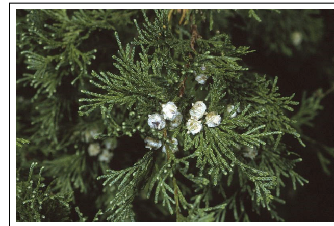
Atlantic White Cedar Foliage and Cones